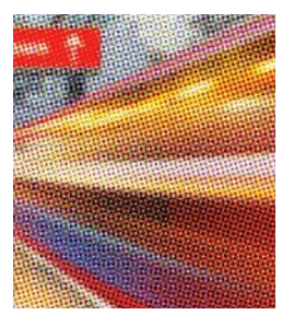
Image selections should help tell a rich, human story and show vertical industry examples, when possible. Use our image library to find images that are open, bright, active, and authentic.